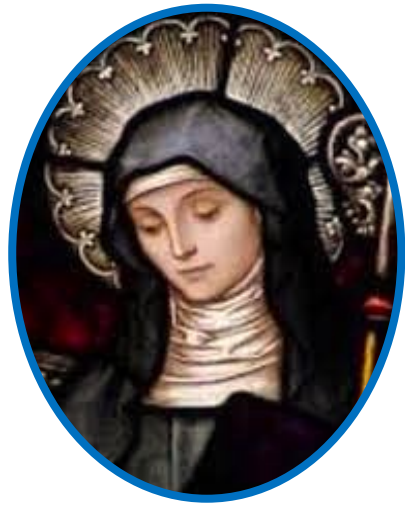
St Moninne of Killeavy 6th July